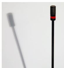
TMD01 version 05.1209.32.CH